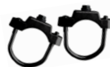
U-Bolt Clamps OTSBR3UBCLAMP3BK (Set of 2 included in package for mounting sign to post)