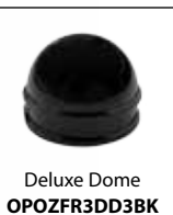
Deluxe Dome OPOZFR3DD3BK