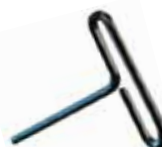
RHBSKT100 Allen Wrench Tool For Set Screws

Custom Products Corporation • 1-800-367-1492 phone • 1-800-206-3444 fax • www.cpcsigns.com