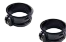
Sign Panel Brackets OSIZ5SPR3BK (2 brackets and black set screws included in package)