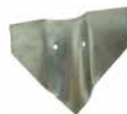
Round Post Anchor Plate BA080APLATE238 (keeps post from rotating)