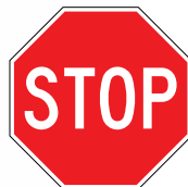
STOP Sign S303OR11HA HIP Sheeting